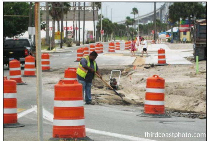
Blue Bay Construction is making progress with the new sidewalk project on Surfside paid for by Bond 2008. Construction on the entryway arch should begin in July.