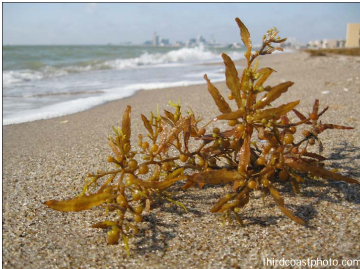
Sargassum - harmless to humans, good for environment

A rule of thumb I use: if I look up and down the shore and notice that everyone is out of the water, I grab a beach chair and read a book or just enjoy the view.