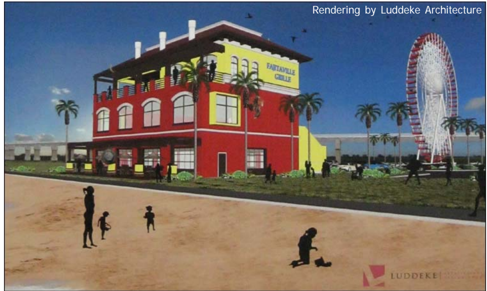
Architect's rendering of Fajitaville depicts three-story restaurant and Ferris wheel.

The Fraziers are hoping to open Fajitaville in July.