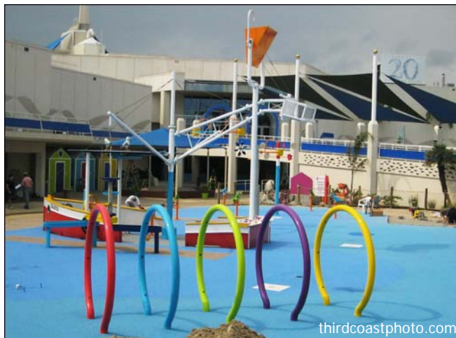
Workers are finishing construction of a splash park being built at the Texas State Aquarium.