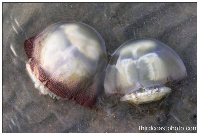
Cannonball or cabbage head jellyfish are usually harmless and often seen in large numbers.