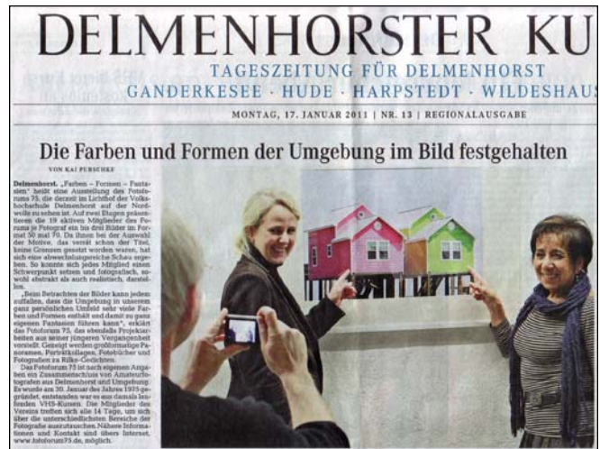
A photo of Beachcomber Cottages taken by a German tourist visiting Corpus was included in an exhibition.