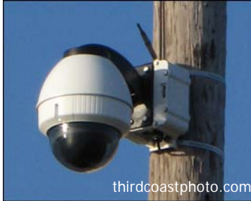
The city has installed four new security cameras along North Beach to help deter crime.

Bond 2012 projects were discussed, as well as a beach parking pass.