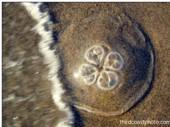
(Above) Moon jellyfish are usually harmless and can be identified by the distinct four round spots, which are actually gonads or sexual organs.