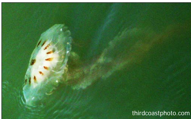
(Left) Atlantic sea nettle, which inflicts a bad sting, has long flowing white tentacles.