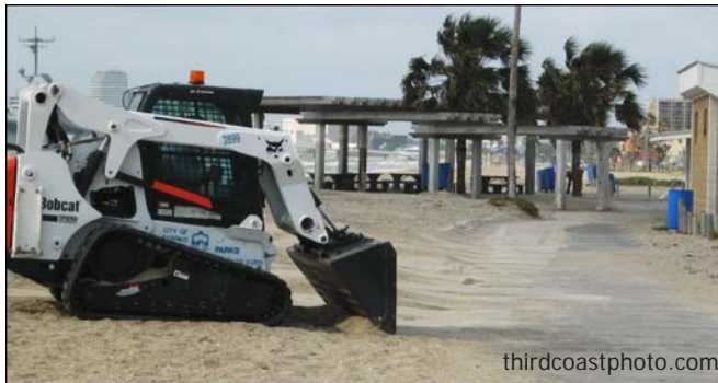
Just before Easter, a Parks employee moves large accumulations of sand from near the Beachwalk at Central Pavilion. The next cleaning will be in late June.